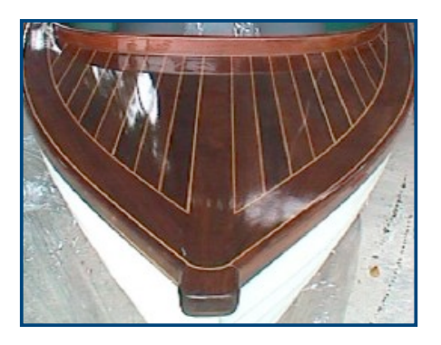
The Harbour Launch "Woodie"

The Pender Harbour Electric Launch Company produces a unique, high quality alternative to a standard outboard runabout. The Harbour Launch is a fiberglass replica of a 16 ft. Northwest Coast wooden lapstrake clinker. Her upper decks and running gear have been carefully redesigned to preserve the elegance and stability of the original, while increasing practicality and durability in addition to reducing operating costs and maintenance.