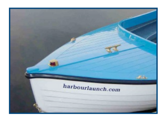
The Harbour Launch "Standard"

The Pender Harbour Electric Launch Company produces a unique, high quality alternative to a standard outboard runabout. The Harbour Launch is a fiberglass replica of a 16 ft. Northwest Coast wooden lapstrake clinker. Her upper decks and running gear have been carefully redesigned to preserve the elegance and stability of the original, while increasing practicality and durability in addition to reducing operating costs and maintenance.